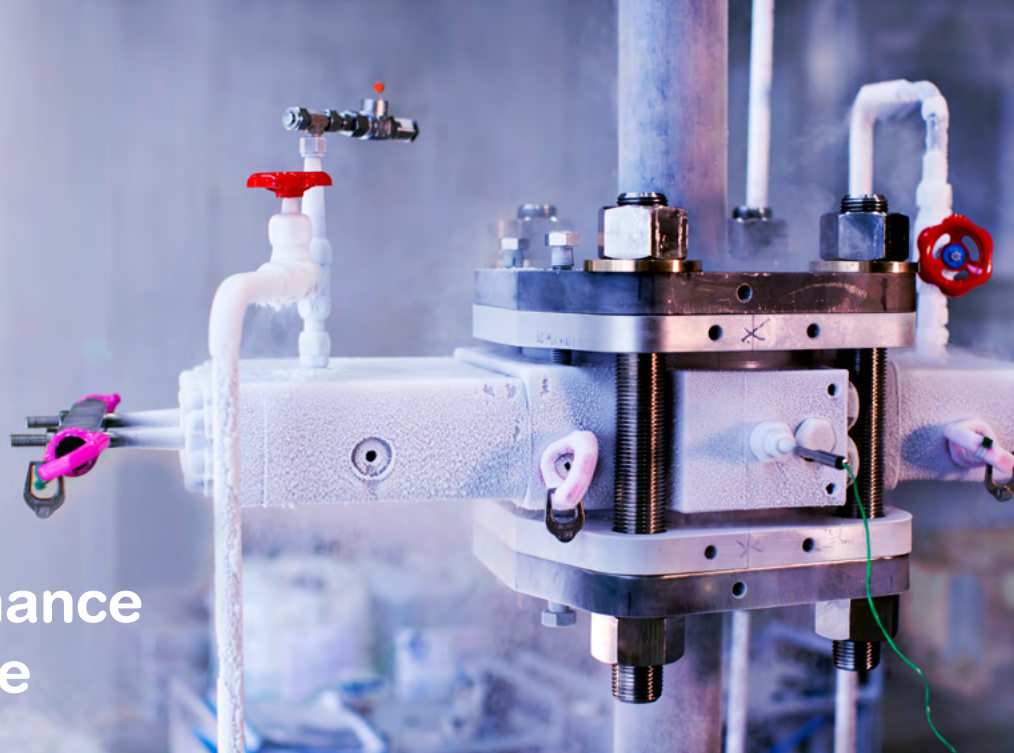
3" AOGV in action